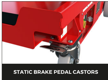
STATIC BRAKE PEDAL CASTORS