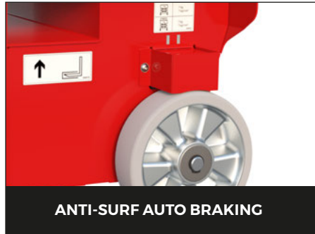
ANTI-SURF AUTO BRAKING