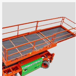
One-key Extended Platform (Apply to JCPT2223)

In addition to all the advantages of engine drive types, in view of the pure electric design, the electric drive rough-terrain scissor lift series also takes into account the environmental advantages of noiseless, zero emission and so on. It is suitable for the operation environment with high environmental requirements, such as SGCC, nuclear power plant, SINOPEC, CNPC, residential area, airport, tunnel, etc.