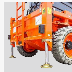
Automatic Leveling Outriggers