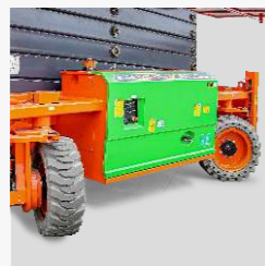
4WD&4WS (Apply to JCPT2223/JCPT2212)